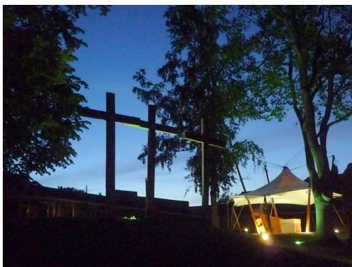
The Shrine at Walsingham, Norfolk—site of the 2014 international pilgrimage

In recent years, the Order of St Lazarus has resurrected (excuse the pun) the notion of an International Pilgrimage. These have proven to be very popular. By their very nature, these sojourns to foreign lands have provided members of the various International Jurisdictions the opportunity to come together in fraternity as the 'Lazarus Family', and to enjoy each other's company in a convivial setting.