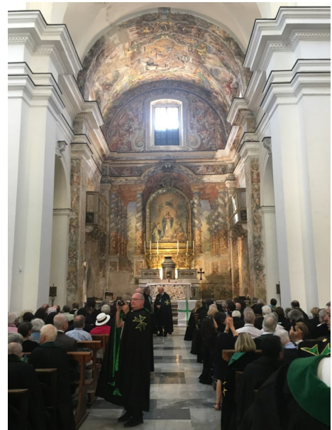
Lazarus pilgrims gather in the Knights' Chapel at Monreale, during the most recent international pilgrimage

This also contributes towards encouraging and supporting smaller national jurisdictions who might otherwise not have the opportunity to have the same level of contact with their overseas confreres and consociates.